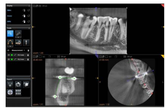
Figure 3 Images obtained from Kodak 9000 software and measurements

Images obtained from the Kodak 9000 software in which axial slices were parallel to the occlusal plane and cross sectional slices were associated with each axial section, were reconstructed (Figure 3). Each section had a thickness of 200 micrometers.