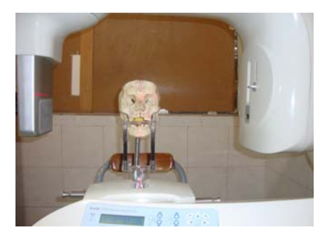
Figure 2 Imaging of the Skull

Images obtained from the Kodak 9000 software in which axial slices were parallel to the occlusal plane and cross sectional slices were associated with each axial section, were reconstructed (Figure 3). Each section had a thickness of 200 micrometers.