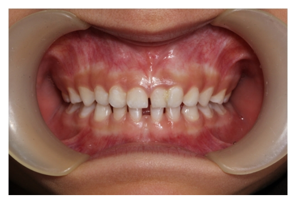
Figure 1: The intra-oral view. Fusion between the primary maxillary left lateral incisor and lateral supernumerary tooth is evident.

In intraoral examination, bilateral supernumerary primary maxillary lateral incisors were found (Figure 1). In the left side, fusion was found between the primary maxillary left lateral incisor and the lateral supernumerary tooth (Figure 1).