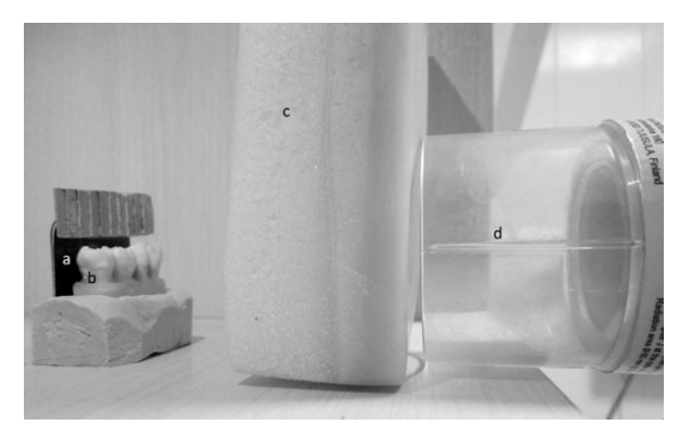
Figure 1a: Photostimulable phosphor plate, b: Mounted teeth, c: Soft tissue simulator, d: Radiography tube

Fifty-two extracted human teeth were evaluated, out of which, 26 were premolars and 26 were molars. The teeth were either intact or had non-cavitated approximal caries. Cavitated and restored teeth were not included. All samples were obtained from dental centers in which the teeth were extracted due to specific reasons rather than current study objectives.