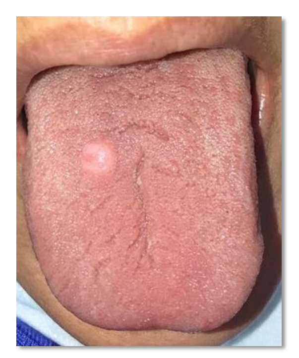
Figure 1: A pink and circumscribed firm mass on the dorsum of the tongue

A 58-year-old woman with a chief complaint of painless mass on the dorsal of the tongue with two years duration was referred to a private dental clinic (Tehran, Iran) in January 2023. The lesion was pink and circumscribed with firm consistency measuring 1×1cm. The surface of the lesion was intact (Figure 1). She mentioned that the surface of the lesion was traumatized a few months ago, but it was healed. A provisional diagnosis of a benign