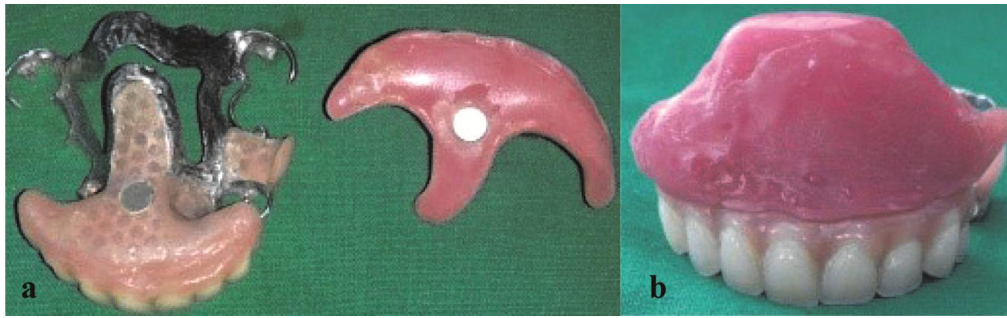
Figure 9a: Magnet attached to definitive prosthesis, b: Two components prosthesis joined together by magnet