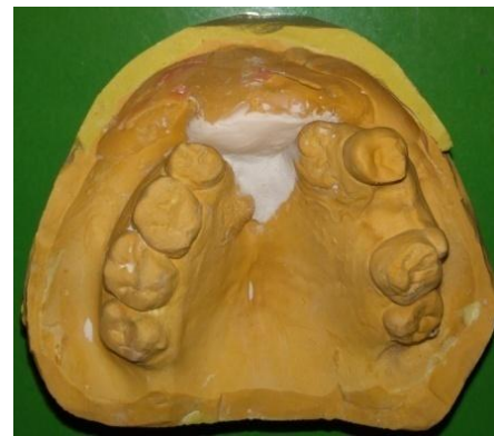
Figure 4: Defect undercut blocked with dental stone

The patient desired a new prosthesis that would provide optimum function, comfort, and esthetics without surgical intervention. Considering the size of the defect, the design necessitated an innovative approach to restore facial harmony, permit nasal breathing, obturate the oronasal communication, replace missing teeth, and restore function. A novel two-component design satisfied the requisites of the prosthesis with a simple path of insertion.