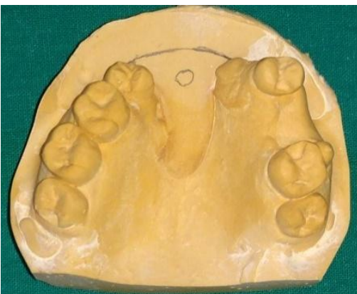
Figure 7: Master cast (after removal of the nasal component)