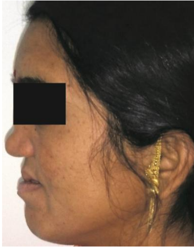
Figure 1: Profile view of the patient