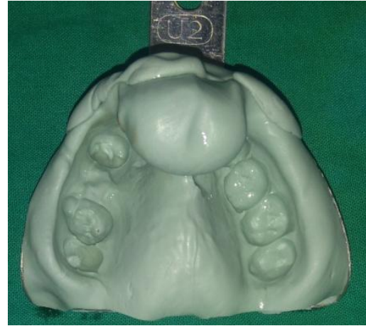
Figure 3: Diagnostic maxillary impression