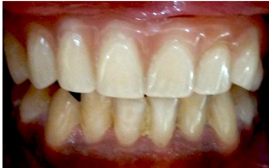
Figure 10: Definitive prosthesis placed in the oral cavity