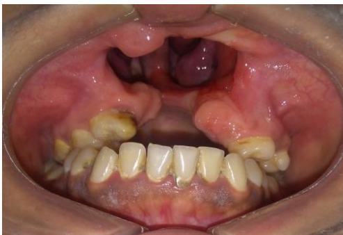
Figure 2: Intraoral view of the defect