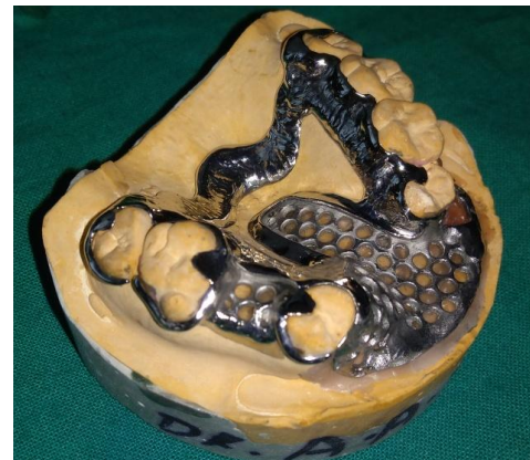
Figure 8: Cast partial denture framework

The maxillary cast with the framework was mounted against the mandibular cast on a semi-adjustable articulator using interocclusal records. Prosthetic teeth were waxed to the framework and evaluated intraorally for phonetics, esthetics, and occlusion. The prosthetic teeth were processed to the framework and the final prosthesis was delivered to the patient. After necessary adjustments, a magnet (5mm magnet, Milestone, India) was attached to the anterior intaglio surface of the processed denture base and its counterpart to the base of the nasal obturator (Figure 9a and Figure 9b).