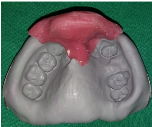
Figure 6: Master impression with nasal component in position

sign requisites. With the nasal component seated in position, a definitive impression was made with silicon impression material (Zetaplus, Zhermack, Badi-aPolesine (RO), Italy) (Figure 6) and the definitive cast was poured with type III dental stone (Figure 7). The definitive cast and detailed instructions were sent to a laboratory for fabrication of the cast RDP framework. The framework was then tried in the patient's mouth and adjusted as necessary (Figure 8). A wax occlusal rim was attached to the framework and interocclusal records were registered in centric occlusion.