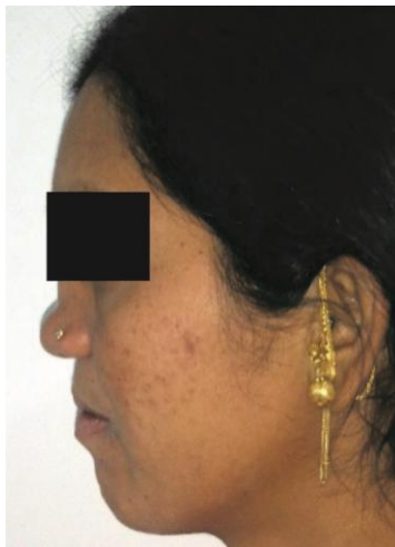
Figure 11: Improvement in esthetics with the definitive prosthesis

By separating the prosthesis into two components, the nasal bulb can be fabricated for maximum obturation, support and retention without regard to the RDP. Likewise, the RDP can be fabricated for maximum support, stability and function based solely on the contours of the remaining abutment teeth and oral soft tissue. Therefore, designing each component separately maximizes mechanical design features. The magnets attach the RDP to the nasal bulb upon insertion of the RDP. Magnets allow an undefined path of insertion prior to