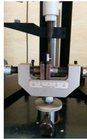
Figure 1: Universal testing machine instrument

The results of the analysis of the FT-IR, XRD, SEM, and EDS tests are explained in our previous study [27]. The results of the \mu SBS test for each study group are shown in Figure 2. Statistical analysis revealed that there were significant differences between the study groups. The highest \mu SBS is observed for silica sol dip coated group (21.66±4.32MPa) respectively and minimum bonding strength was observed in the control group (10.63±3.48MPa). Tukey HSD post-hoc test showed a significant difference in the control group (10.63±3.48MPa) and other groups. There was no significant difference between other groups (sandblasted: 18.25±2.54MPa, aluminosilicate: 17.98±6.99MPa, sili