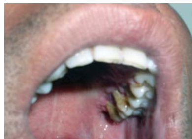
Figure 1 Gingival recession in palatal aspect of left upper premolars and molars

An 18 year old man, with the chief complaint of ulcer and pain on buccal and lingual gingiva of his upper left premolars and first molar, was diagnosed as aggressive periodontitis in the Periodontology Department of Shiraz Dental School (Figure 1).