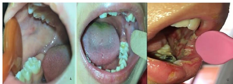
Figure 1: Severity of mucositis in patients, a: Grade 2 mucositis in the test group, b: Grade 2 mucositis in the control group, c: Grade 3 mucositis in the control group