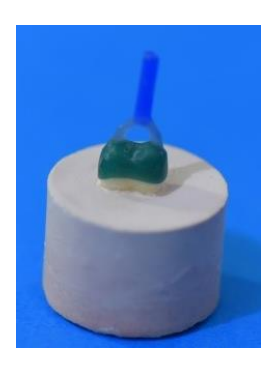
Figure 2: Wax model, a circlet was attached to the occlusal surface

investment stone (Wirovest; Bego Corp., HanauWolfgang, Germany). The investment casting was used to make metal crowns. The crowns were put on the prepared teeth. The marginal fit and seating of the crowns were checked with a fit checker, explorer, and a magnifier. The crowns were finalized with metal finishing stones, burs and 50 \mu m aluminum oxide particles were used to sandblast (Korox, BEGO, Germany) and put in an ultrasonic bath for cleaning (Ultraschall, Dentaurum, Germany) for 60 seconds.