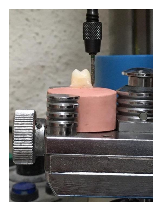
Figure 1: Preparation of a tooth with a milling machine

The teeth were fixed on stone molds (Ariadent, Tehran, Iran) and prepared using a milling machine (Degussa, Germany) with a survey plane parallel to the survey platform. The teeth were positioned as vertically as possible to the surveyor's analysis rod. A round-end taper diamond bur (Dia-Burs, Mani Inc. Tochigi, Japan) was utilized for occlusal reduction, and a torpedo bur (Dia-Burs, Mani Inc. Tochigi, Japan) for axial reduction. Samples with a taper of 6° and a height of 4 mm were used for the study. A final finish line with torpedo bur with width of 0.5-0.7mm was prepared above the cementoenamel junction (CEJ) (Figure 1). Then, the teeth were finalized and any sharpness was removed with abrasive strips [7, 19]. The samples were scanned with a scanner (Amman Girrbach, Germany). The wax patterns with 0.5 mm thickness were designed for each sample and fabricated on the teeth using a CAD/CAM (Ceramill Motion2, Amman Girrbach, Germany) system [20]. A circlet was attached to the occlusal surface of the wax models (Figure 2), and then casted to use as a fixture for retention and testing in a universal testing machine (Zwick Z050; Roell Group, Ulm, Germany) [7, 19]. The wax patterns were embedded using phosphate