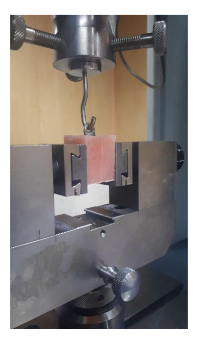
Figure 3: Load application to the samples

The Kolmogorov-Smirnov test results in Table 2 sh-