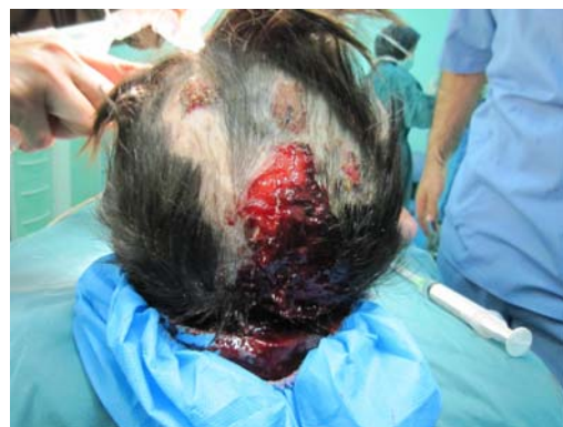
Figure 3 Rupture of few bullae during preparing of the child for general anesthesia

The hair was relatively thin and the fresh lesions could be seen on the scalp. Few bullae ruptured during the preparation of the patient for general anesthesia (Figure 3).