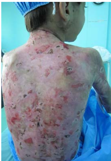
Figure 1 View of patient's back demonstrating many old and new lesions

On routine medical examination, patient appeared normal. She had numerous blistering and multiple disfiguring scars and bullae on her body (Figure 1).