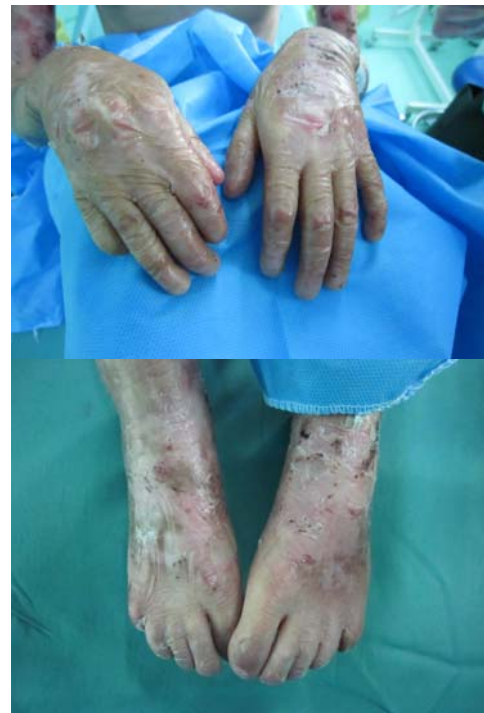
Figure 2 Patient's hands and feet show that the finger and toe nails are lost and various lesions on the skin are present.

The skin over the hands and feet was highly atrophic and the fingernails and toenails were absent (Figure 2).