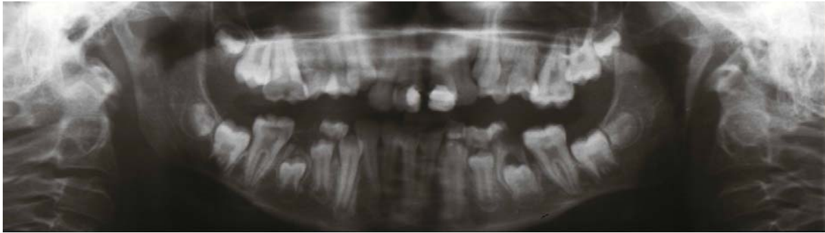
Figure 4 Panoramic radiograph of the patient's dentition ,demonstrating delayed dental development and deep carious lesions on left upper and lower permanent first molars and lower right second primary molar.

A succeeding complete blood count (CBC) showed the Hb and hematocrit levels were raised to 11.5 gm/dl and 39.8% respectively. The total white blood cells and differential count were normal. The difficulty in obtaining blood samples from this patient disallowed extensive hematologic evaluation. Medications such as iron and zinc supplements, vitamin A-D cream and silver sulfadiazine ointment for the skin lesions was prescribed for daily usage.