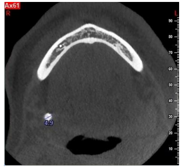
Figure 2: Measuring calcification with CBCT software