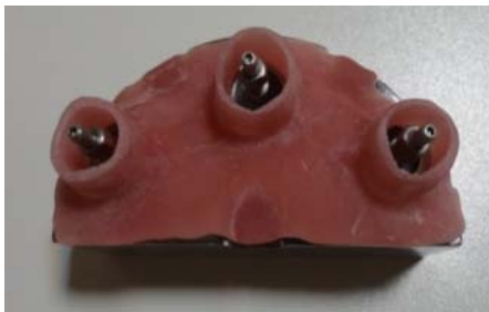
Figure 2 Acrylic customized open tray

was equipped with two guide pins in order to fit the designed tray using open tray method.