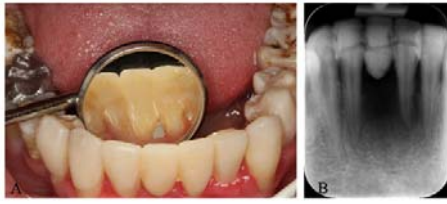
Figure 4a Fiber-reinforced composite bridge: splint design of mandibular incisors.

Finally, the occlusal adjustment of the restorations was performed and the canine guidance discluded all the posterior teeth in the eccentric mandibular movements.