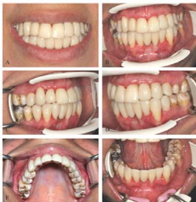
Figure 5 Postoperative clinical pictures: a Smile. b Frontal view. c Lateral view, right side. d Lateral view, left side. e Maxillary arch, occlusal view. f Mandibular arch, occlusal view.

The smile of the patient revealed good esthetics after the performed treatments (Figure 5). Adequate oral home-care regimen was strongly emphasized for the patient. The patient was visited every 3 months for monitoring of the restorations placed. One-year follow up showed good aspect without any debonding, secondary caries, pain and sensitivity.