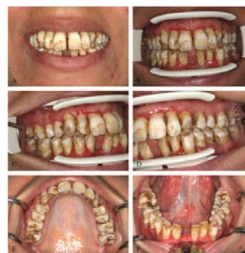
Figure 1 Preoperative clinical pictures: a Smile. b Frontal view. c Lateral view, right side. d Lateral view, left side. e Maxillary arch, occlusal view. f Mandibular arch, occlusal view.

A 21-year-old woman was referred to the department of operative dentistry in the faculty of dentistry for the esthetic rehabilitation. The patient was not satisfied with her smile appearance because of the discolored tooth and excessive length of maxillary incisors. She also needed replacement of the extracted teeth (Figure 1).