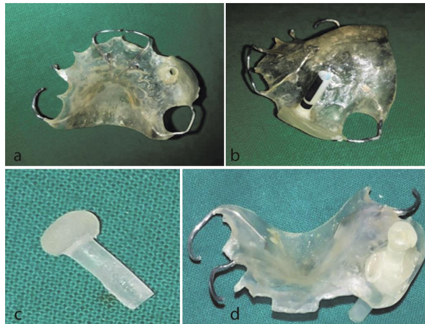
Figure 1: a and b: Modified surgical stent, c: Acrylic stopper, d: Modified surgical stent with acrylic stopper in situ

c, d), which increased convenience and enhanced patient compliance to treatment.