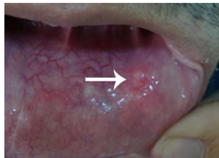
Figure 1 Hemispherical transparent swelling on the labial mucosa (arrow)

painless swelling with paresthesia on his left lower lip. He had a past history of similar lesion diagnosed as mucocele one year earlier, and the lesion was treated by surgery and electrocauterization. Eight months after his first surgery, a new swelling in the earlier place was aroused and remained for 4 months. The size of the lesion did not change during this period on the basis of what our patient reported. There was a hemispherical transparent swelling sized 1x0.7x0.3cm. It was firm and could not be easily ruptured by usual traumatic manipulations (Figure 1).