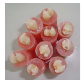
Figure 1 Premolars with completed slot preparation

Then class II slot cavities were prepared on both proximal sides of each premolars using a 245 tungsten carbide bur (SS White; Great White Series, LAKE-OOD, NJ, USA) in a water-cooled high-speed air turbine handpiece. All line angles were rounded. The gingival floor of the slot cavities was located at least 1.0 mm below the CEJ on the root surface. Each slot was 3 mm buccolingually wide and 1.5 mm in axial depth (Figure 1). The dimension of the cavities were verified with a periodontal probe. The teeth were randomly divided into 4 groups (n=4).