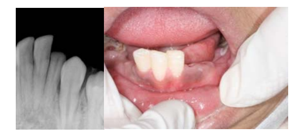
Figure 1 Clinical and radiographic view of fractured incisore

department of Shiraz Dental School, suffering from a traumatic injury. The injury fractured the tooth #23 about 2mm below the crestal bone (Figure 1).