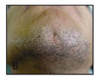
Figure 6A One year follow-up radiograph after periapical surgery. B Complete healing of cutaneous lesion one year after periapical surgery