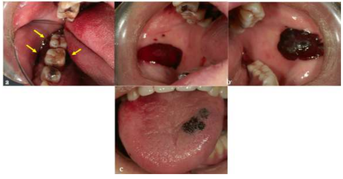
Figure 2: Intraoral findings. (a) Bleeding from the gingiva around the right upper molars (mirror image), (b) hemorrhagic bullae on both sides of the buccal mucosa, and (c) ecchymosis on the dorsum of the tongue

No findings indicative of disseminated intravascular coagulation (DIC) were detected. A bone marrow