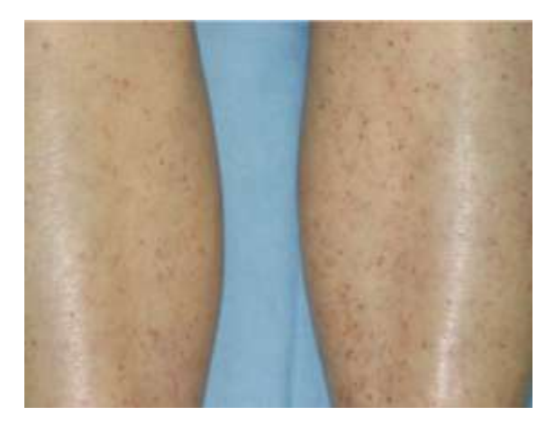
Figure 1: Petechial spots over the lower legs.

Oral and Maxillofacial Surgery at Nara Kasuga Hospital with a complaint of spontaneous gingival bleeding around the right upper molar teeth. The patient noticed continuous bleeding at the right posterior maxilla two days earlier. She was treated with photocoagulation for hemostasis by a general dental practitioner one day earlier. However, the oozing was difficult to control and persisted. She had a medical history of hypertension, which was well controlled with benidipine hydrochloride. There was no history of any bleeding problem, and her family histories were noncontributory. She was moderately nourished. Her vital signs were normal. Extraoral examination revealed petechial hemorrhage over the lower legs (Figure 1).