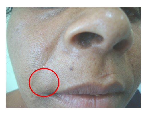
Figure 1: Extraoral photograph showing diffuse swelling obliterating nasolabial fold, elevating the right nasal floor.

A 37-year-old female patient, apparently healthy individual referred to the Department of Oral Pathology complaining of a solitary, painless swelling in the right upper labial mucosa since 4 years that gradually grew in size. No other symptoms were reported before the onset of the swelling. There was no history of any sort of trauma or spontaneous bleeding. The patient did not give history of substance abuse. Extra orally a single, diffuse swelling was present extending from ala of the nose to the corner of mouth (Figure 1).