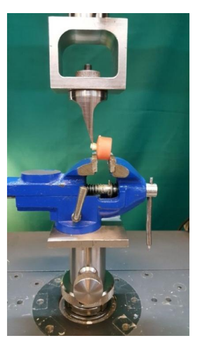
Figure 1: A sample in universal testing machine

Table 1 demonstrates the mean and standard deviation