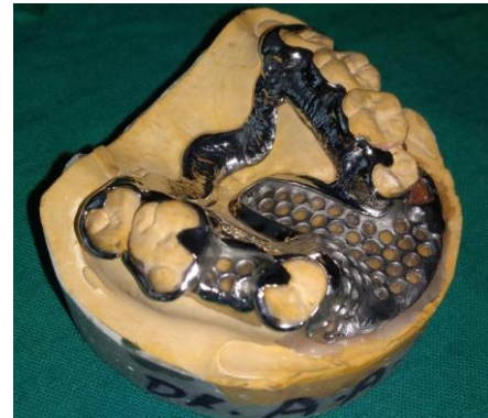
Figure 8: Cast partial denture framework

A wax occlusal rim was attached to the framework and interocclusal records were registered in centric occlusion. The maxillary cast with the framework was mounted against the mandibular cast on a semi-adjustable articulator using interocclusal records. Prosthetic teeth were waxed to the framework and evaluated intraorally for phonetics, esthetics and occlusion. The prosthetic teeth were processed to the framework and the final prosthesis was delivered to the patient. After necessary adjustments, a magnet (5mm magnet, Milestone, India) was attached to the anterior intaglio surface of the processed denture base and its counterpart to the base of the nasal obturator (Figure 9a and Figure 9b). The patient was pleased with her prosthesis (Figure 10 and 11). Home care instructions were given to patient and she was placed on regular recall and maintenance schedule.