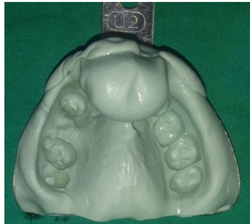
Figure 3: Diagnostic maxillary impression