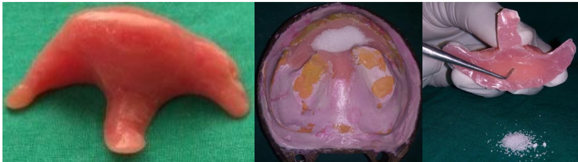
Figure 5a: Nasal component, b: Salt incorporated between doughy acrylic resin layers, c: Removal of salt particles

Zhermack, BadiaPolesine (RO), Italy) (Figure 6) and the definitive cast was poured with type III dental stone (Figure 7). The definitive cast and detailed instructions were sent to a laboratory for fabrication of the cast RDP framework. The framework was then tried in the patient’s mouth and adjusted as necessary (Figure 8).