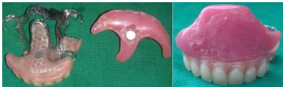
Figure 9a: Magnet attached to definitive prosthesis, b: Two components prosthesis joined together by magnet

A wax occlusal rim was attached to the framework and interocclusal records were registered in centric occlusion. The maxillary cast with the framework was mounted against the mandibular cast on a semi-adjustable articulator using interocclusal records. Prosthetic teeth were waxed to the framework and evaluated intraorally for phonetics, esthetics and occlusion. The prosthetic teeth were processed to the framework and the final prosthesis was delivered to the patient. After necessary adjustments, a magnet (5mm magnet, Milestone, India) was attached to the anterior intaglio surface of the processed denture base and its counterpart to the base of the nasal obturator (Figure 9a and Figure 9b). The patient was pleased with her prosthesis (Figure 10 and 11). Home care instructions were given to patient and she was placed on regular recall and maintenance schedule.