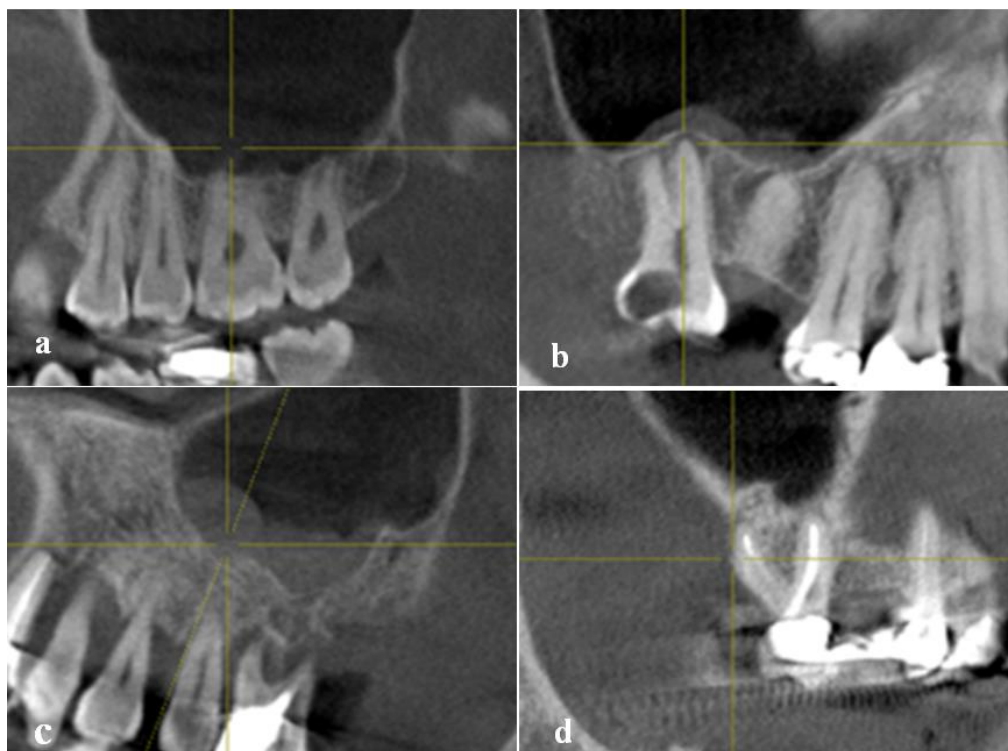
Figure 1: Changes in maxillary sinus observed in CBCT imaging, a: Absence of alteration, b: Mucosal thickening, c: Sinus polyp, d: periostitis