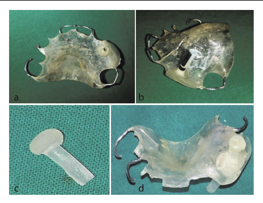
Figure 1: a and b: Modified surgical stent, c: Acrylic stopper, d: Modified surgical stent with acrylic stopper in situ

c, d), which increased convenience and enhanced patient compliance to treatment.