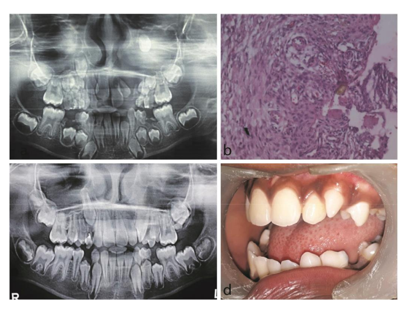
Figure 2: Case 1, a: The panoramic radiograph showing radiolucent lesion, b: Photomicrograph of radicular cyst. (400× magnification, H& E stain), c: 42 months postoperative panoramic radiograph, d: Postoperative intra oral photograph

until resistance was felt. The tube was then attached to the Hawley's appliance with cold cure acrylic (Figure 1a, b). A panoramic radiograph confirmed its position and extent in situ. Finally, an acrylic stopper was prepared to seal the tube during food consumption (Figure 1c, d). Patient's parents were taught to irrigate the lesion regularly through the tube with copious amount of Betadine solution to reduce surgical site infection in accordance with a Cochrane systematic review [5]. Based on radiographic assessment, the length of the tube was frequently trimmed as the permanent canine erupted over a three and a half year period (Figure 2c, d). Overall, our modification allowed for the uninterrupted drainage of cystic fluid into the oral cavity, which led to the decompression of the cystic lesion. Patient had to report to hospital once or twice in 3 months for radiographic assessment and tube trimming. This was much lesser frequency compared to alternate day visit required for medicated gauze packing method. Once the permanent canine was closer to eruption, patient discontinued the wearing of the appliance. A total 42 months follow up was maintained until the permanent canine erupted into the oral cavity.