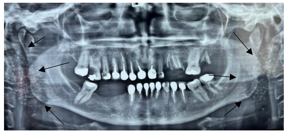
Figure 1: The panoramic image shows multiple dental caries and multiple globular radiopacities behind the mandibular ramus on both sides associated with the parotid gland

During the 3-month follow-up, the patient showed improvement in dryness of the eyes and mouth. Additionally, a fine-needle aspiration (FNA) was requested under sonographic guidance to rule out mucosa-assisted