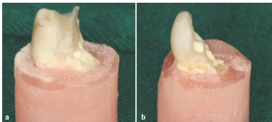
Figure 3: The samples of restorable/ non-restorable sample fractures, a: Restorable fracture, b: Non-restorable fracture

In our study, no significant difference in FR was observed between bulk-fill and conventional composite resin restorations. This finding was in agreement with result of the latter study as mentioned above [27]. However, Ghajari et al. [28] assessed FR of pulpotomized