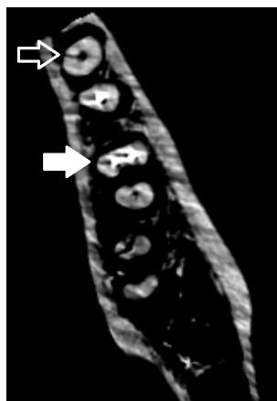
Figure 2: An axial section of CBCT shows a fracture in a non-filled root (the hollow arrow) and a streaking artifact mimics the fracture line in a root canal filled with gutta-percha (the solid arrow)

Our results corroborate the previous findings that reported DPR was more specific than CBCT for VRF diagnosis in root-filled teeth. [7, 17] Inconsistent with a study that reported the significance of the difference between the specificity of the two modalities, [17] our findings confirmed the insignificance of this difference. [7] Higher DPR specificity is probably due to the two-dimensional nature of DPR. Fractures are more likely to be covered by root filling materials and superimpositions in DPR. Thus, the teeth are mostly reported as non-fractured and the number of false positives will be reduced. On the other hand, root filling materials can lead to beam hardening and produce streaking artifact in CBCT images. This artifact may mimic the fracture line and, therefore, mislead the clinician to mistake this low-density area for a root fracture. [18-19] (Figure 2)