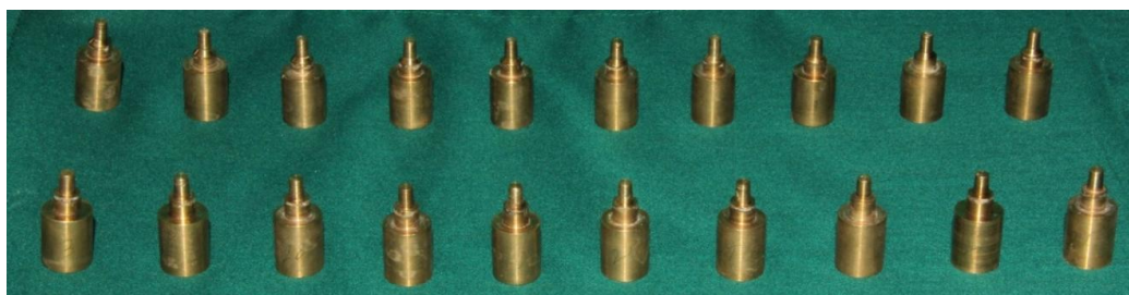
Figure 1: Master dies

In this in vitro study, 20 standard brass dies were designed and prepared by CNC milling machine (CNC 350; Arix Co. Tainan Hsin, Taiwan) (Figure 1). Preparation was standardized using a wide smooth continuous margin, free of any irregularities. Each die was made to provide 6° occlusal convergence angle, and axial occluso-gingival height of 6.4mm, 5.5mm base width and 1.2mm margin thickness; half of the samples had a 135° shoulder margin (Figure 2a) and the other half with a 90° shoulder margin (Figure 2b) (n=10). The brass dies were visually inspected for any possible irregularities by a single operator utilizing a binocular loupes (Heine HR-C 2.5*; Heine, Herrsching, Germany).