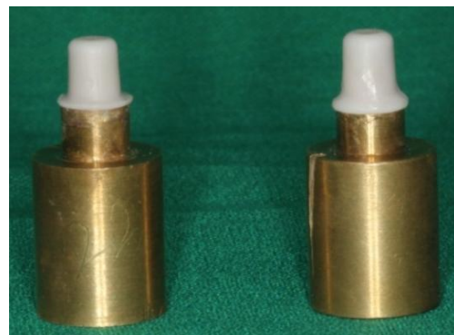
Figure 3: Zirconia copings placed on master dies

The null hypothesis of this study was rejected because the margin design was found to have significantly affected the fracture strength of zirconia copings, and copings with 135° shoulder margin were significantly more resistant than those with 90° shoulder.