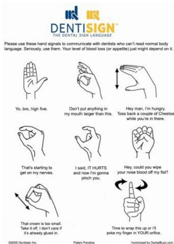
Figure 1: Dentisign. [12]

In the study group, 20 children were divided into groups of 10 each, for convenience to effectively educate dental sign language. The dental sign language specific to dental treatment was educated by trained professionals using visual aids. (Figure 1, 2) During their visit to the dental clinic, a quick review of dental sign language using the visual aids was given before the treatment, which acted as reinforcement. All treatment procedures and instructions to be followed were explained using the dental sign language by the operating dentist. During the procedure, use of dental sign language was repeated for giving instructions and also for reassurance to patients, which acted as a means of communication.