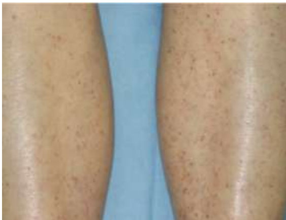
Figure 1: Petechial spots over the lower legs.

Oral and Maxillofacial Surgery at Nara Kasuga Hospital with a complaint of spontaneous gingival bleeding around the right upper molar teeth. The patient noticed continuous bleeding at the right posterior maxilla two days earlier. She was treated with photocoagulation for hemostasis by a general dental practitioner one day earlier. However, the oozing was difficult to control and persisted. She had a medical history of hypertension, which was well controlled with benidipine hydrochloride. There was no history of any bleeding problem, and her family histories were noncontributory. She was moderately nourished. Her vital signs were normal. Extraoral examination revealed petechial hemorrhage over the lower legs (Figure 1).