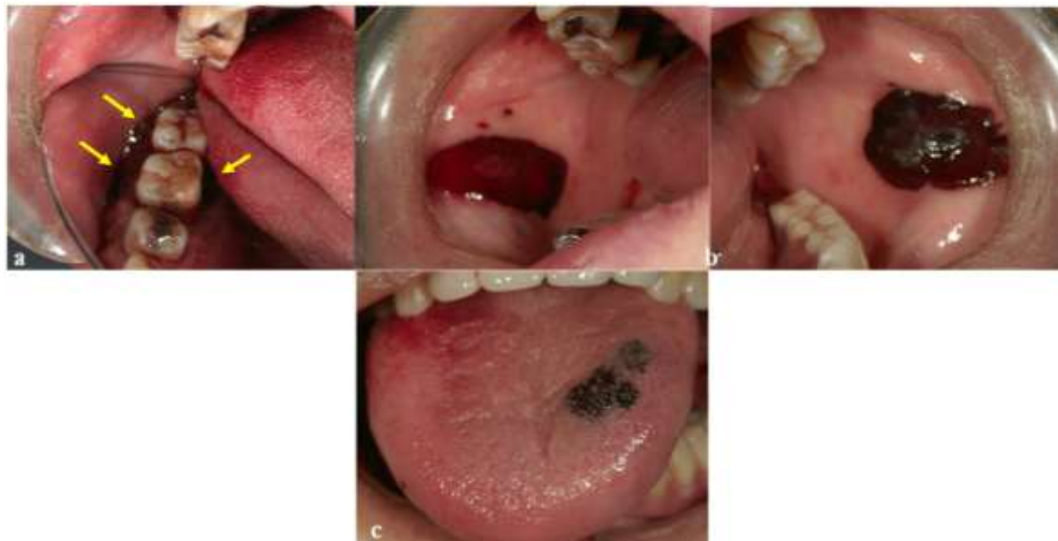
Figure 2: Intraoral findings. (a) Bleeding from the gingiva around the right upper molars (mirror image), (b) hemorrhagic bullae on both sides of the buccal mucosa, and (c) ecchymosis on the dorsum of the tongue

There was no obvious lymphadenopathy. Intraoral