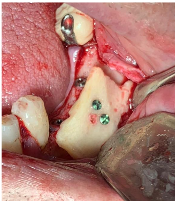
Figure 1: Clinical view of implant site after fixation of lateral ramus block bone graft

the recipient site was perforated using drills under saline irrigation to ensure vascularization of the bone block. The bone block was re-contoured using a diamond bur and adapted to the recipient site. It was fixed to the residual ridge with fixation miniscrews (Jeil, Seoul, Republic of Korea). The fixation of the bone block was performed after implant placement in the group 1 (Figure 1). The gaps between the recipient site and the bone blocks were filled with bone substitute material (Cerabone®), and a membrane (Jason®) covered the grafting site (Figure 2). Tension-free closure of the flap was performed with interrupted sutures. The patients were instructed to use postoperative antibiotics (amoxicillin 500 mg/8 h or clindamycin 300 mg/8 h if allergic to penicillin) and 0.2% chlorhexidine mouthwash for seven days.