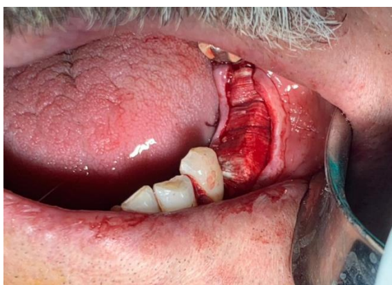
Figure 2: Clinical view of implant site after membrane placement