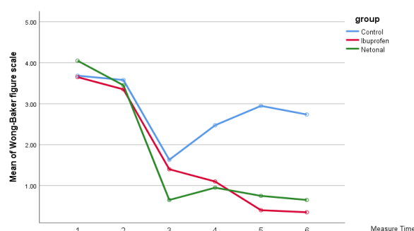
Figure 3: Mean wong-baker faces pain scale (WBFPS) score in the three groups

groups was not significant neither in VAS nor in WBFPS pain score ( p > 0.05 ). The within-group comparison of pain scores over time revealed a descending trend from T1 to T6 in both VAS and WBFPS pain scores in U. dioica and ibuprofen groups ( p = 0.001 ); however, in the control group, both VAS and WBFPS pain scores had an ascending trend from 8 to 12, and 24 hours, postoperatively ( p = 0.001 ) (Figures 2-3).