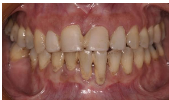
Figure 1: Frontal view showing plaque and calculus accumulations, gingival inflammation, and periodontal complications around all teeth

type evaluation revealed insufficient oral hygiene with plaque and calculus accumulation and the presence of periodontal complications all over the teeth (Figures 1-2). At the level of the upper anterior maxilla, a slight inflammation of thick periodontal tissues was noticed. The measurements of the sulcus depth and attachment level of both central incisors at the mesio-buccal, mid-buccal, disto-buccal, disto-palatal, mid-palatal, and mesio-palatal sites exhibited the presence of a localized periodontal pocket with more than 10 mm of probing depth at the mesial site of the right central incisor (tooth number 11). The concerning tooth presented a slight bucco-palatal mobility limited to 2 mm. Radiographic examination (Figure 3) showed advanced vertical bone resorption at the mesial side of tooth number 11, extending to the third apical part of the root. A mechanical supra gingival scaling and subgingival root planning were performed and a mouthwash (0.1% chlorhexidine and 0.5% chlorobutanol) was prescribed for a period of 10 days to assess the periodontal tissue response. The patient expressed that it was impossible for her to stop smoking, as she has tried several times without result, and she has resumed smoking each time. After several