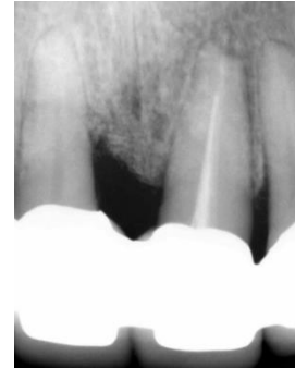
Figure 15: Peri-apical radiograph at 2 years post-surgery, with a substantial stability of the grafted bone, and significant adaptation of the prosthetic elements