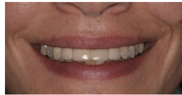
Figure 16: Clinical photos at 2 years post-operatively showing the respect of an esthetic smile