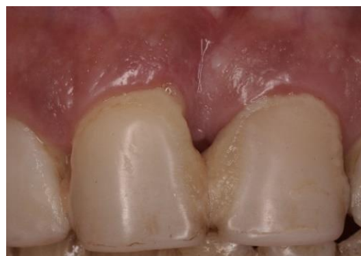
Figure 2: Clinical photo of both central incisors with an acquired diastema and anesthetic restorative treatment