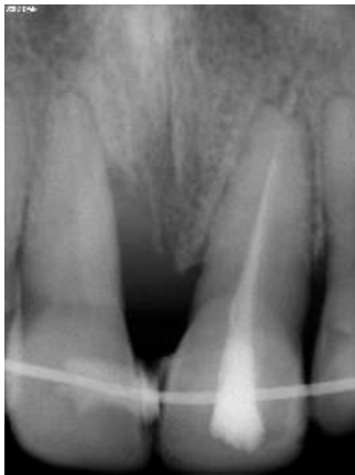
Figure 3: A vertical bone destruction extending to the third part of the root at the mesial site of the right incisor is visible on a peri-apical radiograph