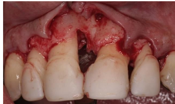
Figure 5: Vertical bone resorption at the mesial aspect of the right incisor was identified when performing buccal and palatal flap elevation

The buccal flap was elevated full thickness to expose 2 to 3mm of alveolar buccal bone, followed by a split thickness in order to facilitate a coronal displacement of