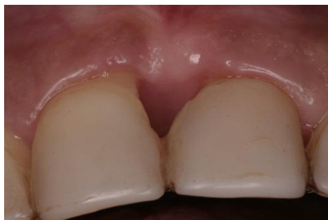
Figure 13: Three months post-operatively, complete soft tissue healing with perfect continuity of the papilla between two central incisors is noted