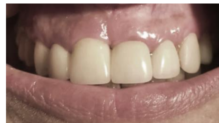
Figure 19: A healthy soft tissue with respect of the marginal contour is still maintained after 12 years of guided tissue regeneration technique and prosthetic performance