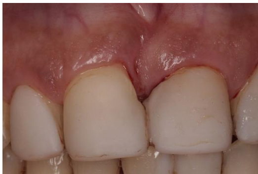
Figure 4: Clinical photo assessed the periodontal soft tissues status 3 weeks after scaling and root planning

education sessions on the harmful effect of smoking on tissue healing after surgery, she accepted to follow the smoking cessation program, which consisted of stopping smoking one week before surgery and three weeks post-operatively. The patient returned for surgical treatment after 3 weeks (Figure 4).