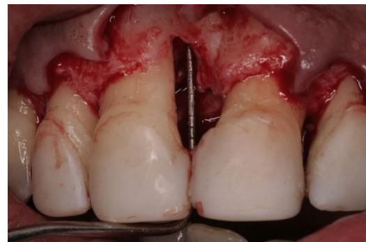
Figure 6: Measurement of the bone defect showing a 2mm depth of a 3-wall defect

the flap itself. The palatal flap was elevated full thickness. Elevation of flaps exposed a deep vertical bone resorption at the mesial aspect of the right incisor (Figure 5), with a 2mm depth of a three-wall defect in the apical part (Figure 6), a 3 mm depth of a two-wall defect in the middle side (Figure 7), and a 2 mm depth of a one-wall defect in the coronal part. Root surfaces were slightly scaled using ultrasonic and hand curettes, then the technique of guided tissue regeneration was applied using xenograft bone substitute Bio-Oss® (Figure 8), covered by a resorbable bilayer collagen membrane (Geistlich biomaterial Bio-Gide®) trimmed and adapted without the need for fixation tools (Figure 9). The buccal and lingual flaps were subsequently positioned coronally, ensuring maximum coverage of the membrane (Figure 10), using interrupted single sutures with 5-0 monofilament non-absorbable polyamide (Ethicon® US) (Figure 11). An association of amoxicillin 500 mg and metronidazole 250 mg was prescribed three times a day for eight days with analgesics for the first two days or as needed. The patient was instructed to rinse with a 0.2% chlorhexidine solution three times a day for 15 days, starting 24 hours post-operatively.