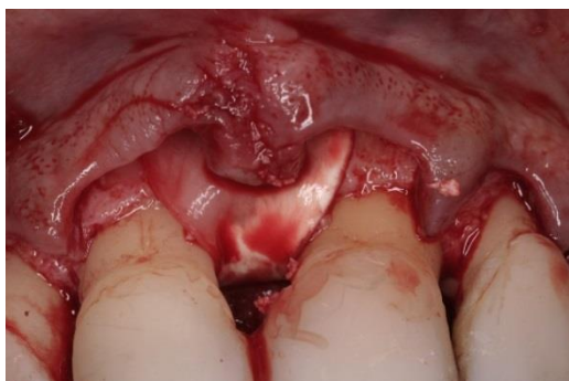
Figure 10: Flap adaptation, note the presence of an intact papilla between the incisors allowing a complete coverage of the membrane

Sutures were removed 10 days following the surgery, and the patient was scheduled for a recall visit every two weeks for prophylaxis. Ten days after sutures removal and before the first assessment appointment, the patient mentioned that something white was coming out of the gingiva and urgently asked for an examination. At that visit, 20 days post-surgery, the clinical exam revealed a 2 mm of membrane exposure without any sign of infection (Figure 12). A reinforcement of oral hygiene with a local ointment with chlorhexidine 0.2% was suggested, and the follow-up appointment was cut down to once a week. Three months post-surgery, clinical and radiographical assessments showed excellent soft tissue healing (Figure 13) and perfect hard tissue stability (Figure 14). The patient was asked to keep following the oral hygiene instructions and to return after 3 months for prosthetic rehabilitation. No modification of tooth preparation or of prosthetic margins of the temporary restoration was made during the 6-month post-operative period, leading to the complete maturity of the supra osseous soft tissues and the stability of the gingival margin. At 6 months, a four-unit zirconia bridge was performed based on patient esthetic compliance, the case was documented clinically and radiographically, and a follow-up maintenance program was scheduled.