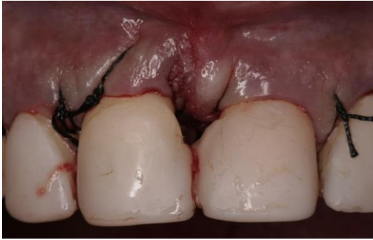
Figure 11: Photo showing a tension free flaps adaptation with interrupted single sutures