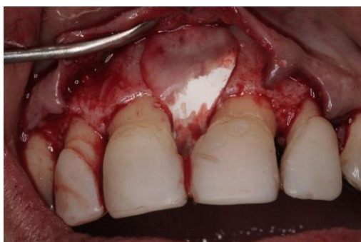
Figure 9: A Collagen membrane (Bio-Gide) adapted in place, covering the defect