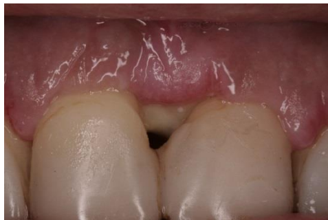
Figure 12: Clinical view 20 days post-surgery showing 2mm of membrane exposure