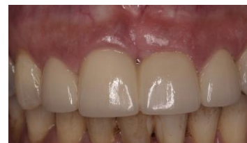
Figure 17: Clinical photo at 2 years post-operatively showing the respect of a soft tissues contour with adequate prosthetic crown integrations