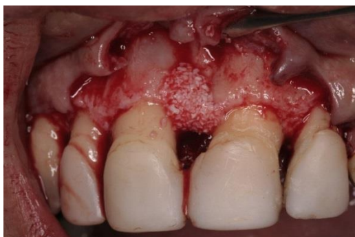
Figure 8: A bovine bone substitute (Bio-Oss) filling the bone defect at the mesial site of tooth number 11