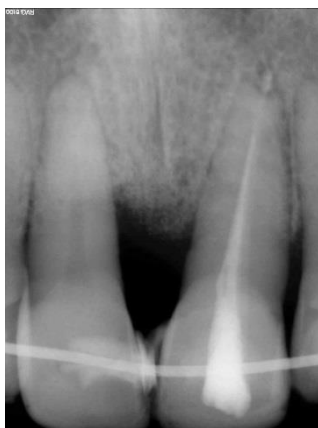
Figure 14: A control radiograph at 3 months post-surgery evaluating the volume stability of the added bone