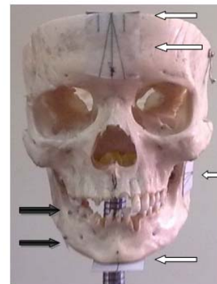
Figure 1 The black arrow position of the markers. White arrows location of the pages

Four small sheets of paper were installed on the skull, containing linear measurements and angles required for positioning (Figure 1).