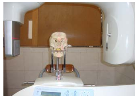
Figure 2 Imaging of the Skull

Images obtained from the Kodak 9000 software in which axial slices were parallel to the occlusal plane and cross sectional slices were associated with each axial section, were reconstructed (Figure 3). Each section had a thickness of 200 micrometers.