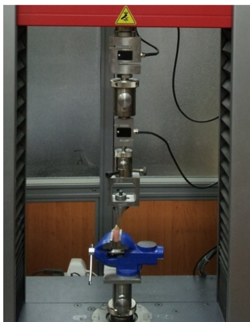
Figure 1: The samples under the SBS test in the universal testing machine

dried. Finally, composite resin build-up procedure was done. All the bleached surfaces were etched by using 37% phosphoric acid gel for 15 seconds (Total Etching Gel; Ivoclar Vivadent, Schaan, Liechtenstein). Then they were rinsed with water spray for 15 seconds, Adper Single Bond (3M ESPE; Dental Products, St Paul, MN, USA) was applied, and light-cured by an LED unit (Demi Plus; Kerr, Switzerland) for 20 seconds at a light intensity of 1200 W/cm 2 . Finally, the restoration procedure was done with composite resin (Filtek Z350; 3M Dental Products) by using a Teflon mold (5×2 mm). They were light-cured for 20 seconds by the same LED light-curing unit. All the samples were immersed in distilled water at room temperature for 24 hours. For measuring the shear bond strength, the samples were placed in a universal testing machine (ZwickRoell Testing Machine Z020; Germany) with a blade-shaped tip, and the force was applied to the composite resin–enamel interface at a crosshead speed of 0.5 mm/min (Figure 1).