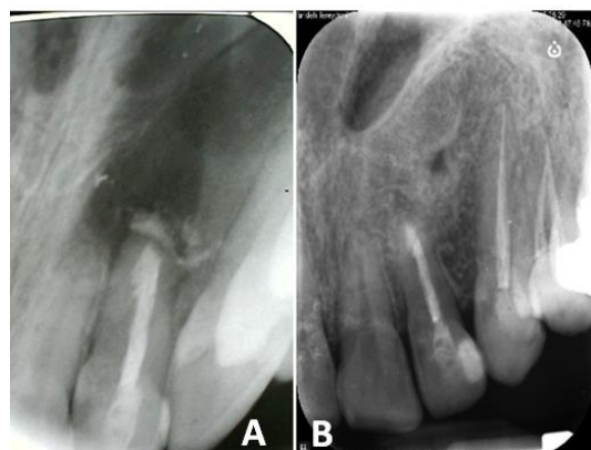
Figure 3a: Surgical retreatment, b: Follow-up image after 6 years; the periapical radiolucency has disappeared