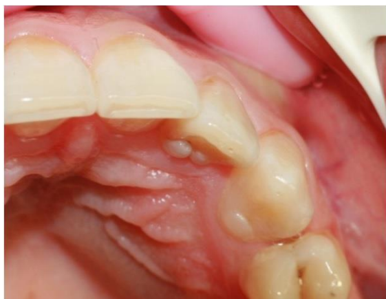
Figure 1: The protuberated gingivum in the palatal aspect of the left maxillary lateral incisor

palpation, and tenderness to percussion was mild.