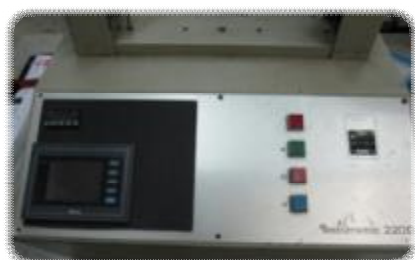
Figure 2: Testometric machine 220 D

and conventional brackets were tied with ligature wire. Oral cavity condition was simulated with un-stimulated saliva of the operator who had orthodontic appliance in his mouth. Saliva was applied with dropper to arch wire for each examination. The movable bracket was attached to the center of a brass bar with a cyanoacrylate and a 100 g weight was hung at a 10 mm distance from the center of bracket in order to represent equivalent single force acting on the resistance center of the tooth. The entire test was done using Testometric machine (220 D; Testometric co., unit 1, Lancashire, UK) with a cross head speed of 5 mm/min (Figure 2). The movable bracket was hung to the load cell throughout the test.