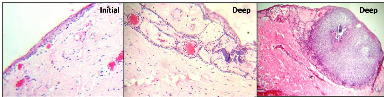
Figure 3: Initial section depicting dentigerous cyst versus deeper section representing Adenomatoid odontogenic tumor

selected cases (referred to as prospective deeper sections), while others request additional deeper sections if the pathologist is unable to diagnose from the initial section (referred to as retrospective deeper sections). [8] Though this practice provides enough evidence for better diagnosis for oral biopsies, but preparing and examining more sections can increase cost and cause delay in dispatching of report (particularly in case of retrospective deeper sections). Therefore, the question that comes to mind of every oral pathologist is what should be the standard protocol for prospective deeper sections so that the time and money could be saved with diagnosis that is more appropriate?