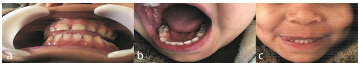
Figure 2a: Gingival lesion was recovered, b: The oral aphthous lesions of the patient after 10 days of conservative therapy, c: Pallor malar rash

After consultation with a neurologist and a nephrologist, it was confirmed that CNS and the renal system were not involved considering the normal urinalysis. Based on the clinical findings and the laboratory results (6 out of 11 criteria), the diagnosis of cSLE was confirmed regarding the American College of rheumatology (ACR) (Table 2) revised criteria for diagnosis of SLE [18]. The positive criteria included malar rash, oral ulcers, discoid rash (scalp lesions), photosensitivity in malar rash, antinuclear antibody, immunologic disorder (positive ANA, c-ANCA, and CRP). A rheumatologist was consulted and oral prednisolone (5 mg, twice daily) and oral hydroxychloroquine (5mg/kg once daily) was administered. The patient was followed up and after 10 days of therapy, the oral aphthous lesions were recovered and the malar rash disappeared (Figure 2). The patient was able to eat and drink and her weight increased after a month. In 6-month follow-up visit, there was no relapse and no lesion was detected. There was no renal and CNS involvement. The patient was recommended to continue the therapeutic regimen until 6 years of age. Relevant written consents have been obtained before publishing the case report.