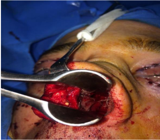
Figure 3: Rotational mucosal flap was performed on one side of septum