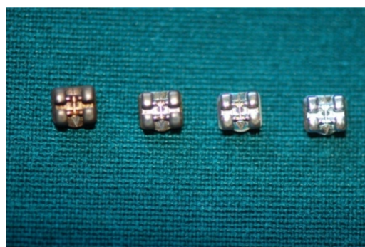
Figure 3: Brackets color changes after coating with CuO-ZnO nanoparticles, CuO nanoparticles and ZnO nanoparticles in comparison with controls (left to right).

Although the findings of this study on the antimicrobial effect of brackets in short-term were positive, other investigations should be carried out in order to prove our notion.