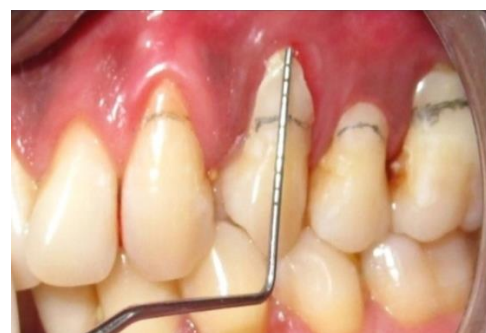
Figure 1: Preoperative analysis

After giving local anesthesia, initially, an intrasulcular incision extending from distal side of 22 to the distal side of 26 was given using blade number 15. A full thickness mucoperiosteal flap was elevated on the buccal aspect of the teeth being treated, followed apically with a partial thickness dissection beyond mucogingival junction. The area was debrided and cleaned thoroughly. Supercell was then placed (Figure 5) and flap was coro-