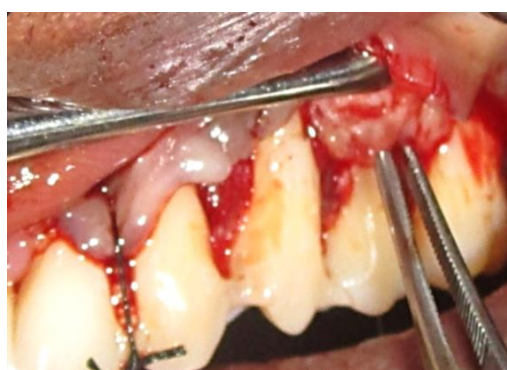
Figure 5: Placement of supercell

The present case report aimed at treating multiple Miller’s Class-II gingival recessions with CAF and supercell. PRP, PRF, and platelet gels are autologous materials with high platelet concentration that integrate the advantageous properties of growth factors in platelets and fibrin sealants and thereby provide optimal growth factor release at the site of injury. The application of these preparations revolves around the tenet that, growth factors have a key role in soft and hard tissue repair mechanisms [10]. Amongst the various platelet concentrates, PRFM allows a sustained, effective dispensation of growth factors to the wound site.