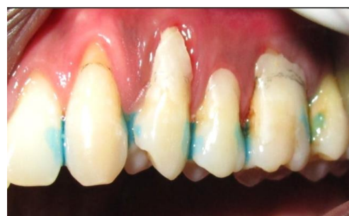
Figure 2: Blocking of the contact points with composite