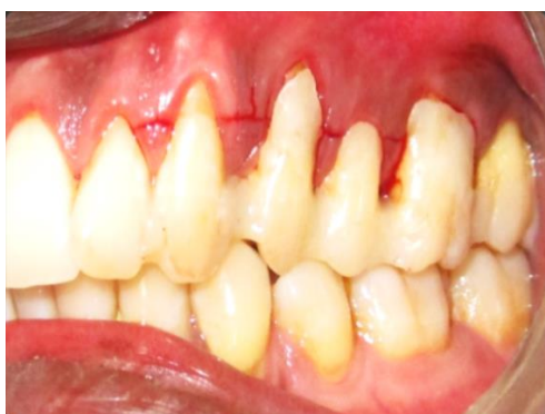
Figure 4: Anticipated root coverage marked