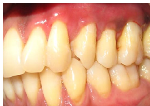
Figure 7: Three months after surgical procedure