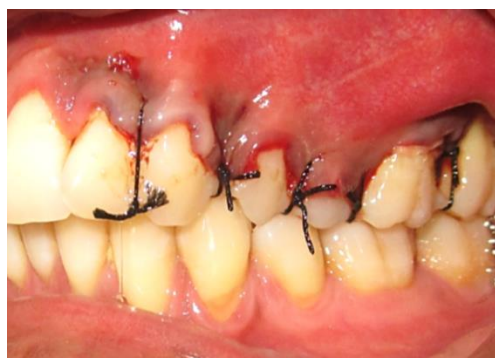
Figure 6: Coronal advancement of flap and placement of sutures