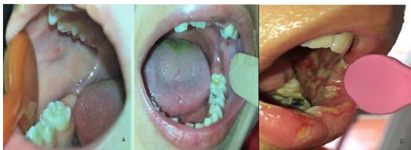
Figure 1: Severity of mucositis in patients, a: Grade 2 mucositis in the test group, b: Grade 2 mucositis in the control group, c: Grade 3 mucositis in the control group