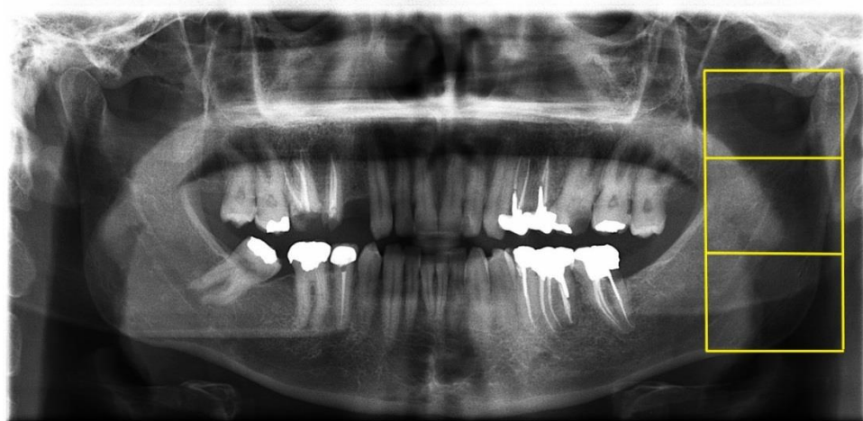
Figure 3: Inferior alveolar canal origin location