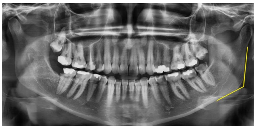
Figure 2: Gonial angle

The results showed in %97.15 of cases, the middle third area of ramus was the entrance point of canal and the entrance point of canal in the lower third area was not observed in any of the images. No significant difference was observed in men and women considering the entrance point of the canal. This correlation was analyzed by Chi-Square test and was not significant with p= 0.76 , meaning that the location of entrance of canal in different genders were the same. Moreover, this was also true about different age groups ( p=0.76 ); the locations of canal entrance in different age groups were the same.