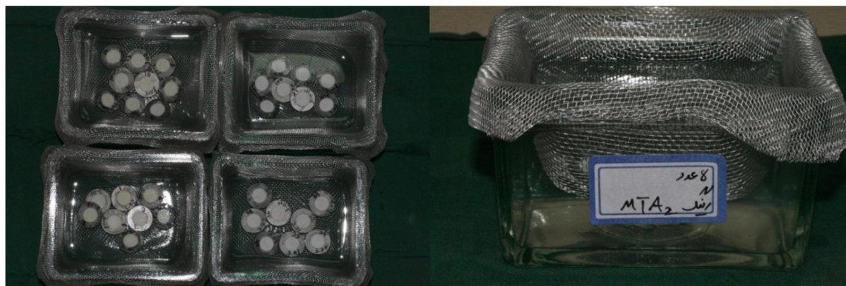
Figure 1: The containers with experimental ring moulds immersed in STF. Each mould has a code to record its weight before and after the immersion time period.

experimental groups 2 and 4 was selected to evaluate with scanning electron microscopy (SEM) at a magnification of 500 \times . The weight changes of the experimental materials were analysed by the two-way analysis of variance (ANOVA) test (SPSS, version 20) at a significance level of 5 % ( \alpha = 0.05 ).