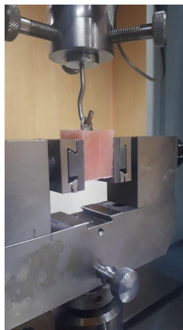
Figure 3: Load application to the samples

The Kolmogorov-Smirnov test results in Table 2 show the bond strength data followed normal distributions