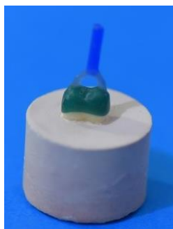
Figure 2: Wax model, a circlet was attached to the occlusal surface

investment stone (Wirovest; Bego Corp., Hanau/Wolfgang, Germany). The investment casting was used to make metal crowns. The crowns were put on the prepared teeth. The marginal fit and seating of the crowns were checked with a fit checker, explorer, and a magnifier. The crowns were finalized with metal finishing stones, burs and 50 \mu m aluminum oxide particles were used to sandblast (Korox, BEGO, Germany) and put in an ultrasonic bath for cleaning (Ultraschall, Dentaureum, Germany) for 60 seconds.