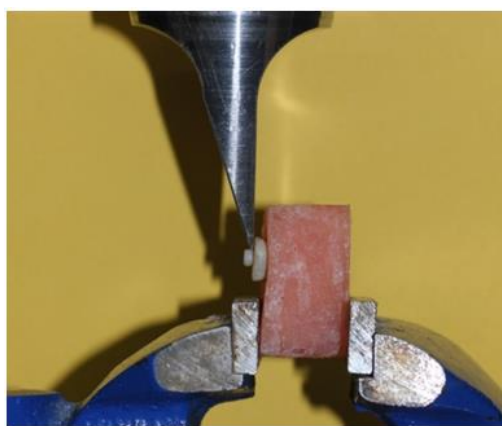
Figure 1: A sample in universal testing machine

The load observed at fracture (N) was divided by the cross-sectional specimen area to convert results into units of was calculated in MPa.