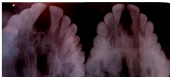
Figure 3 Occlusal radiograph revealed the unilocular appearance of the lesion

The Panoramic radiography showed resorption of the bone in the region of the incisor teeth (Figure 2). However occlusal radiography revealed a well-demarcated unilocular radiolucent lesion with pear-shaped appearance involving the incisive canal region (Figure 3).