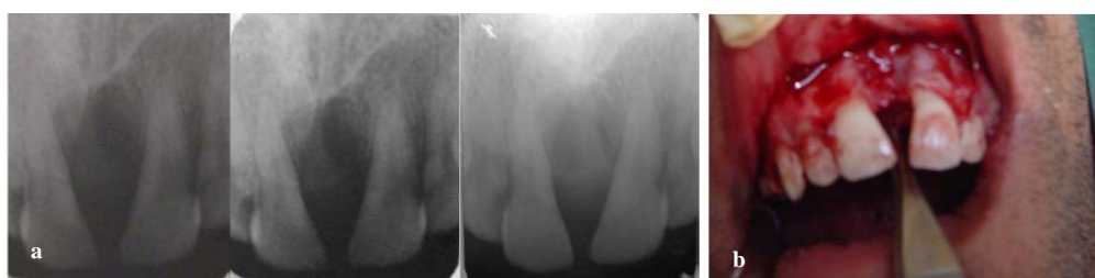
Figure 5a Periapical radiograph after six month follow-up. There were no findings of recurrence b There was no sign of recurrent after six months follow-up

An excisional biopsy has been performed and the tumor removed completely. After surgery the patient, has been followed by periodic radiological examinations,