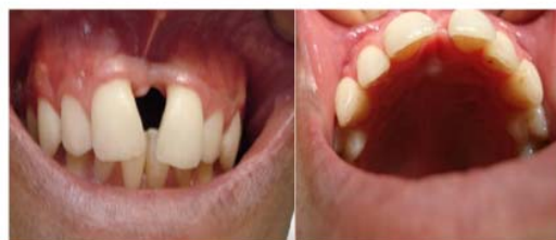
Figure 1 Intraoral examination revealing no buccal and palatal swelling

A 24-year old male referred to the department of oral