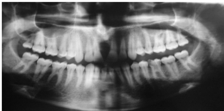
Figure 2 Panoramic radiograph showing a unilocular radiolucent area between central incisors. Note the roots of two central incisors are displaced distally

medicine, Esfahan Dental School (Esfahan University of Medical Sciences) for orthodontic treatment, complaining of diastema between his anterior teeth. Initially, the patient had no signs and symptoms such as pain and swelling (Figure 1).