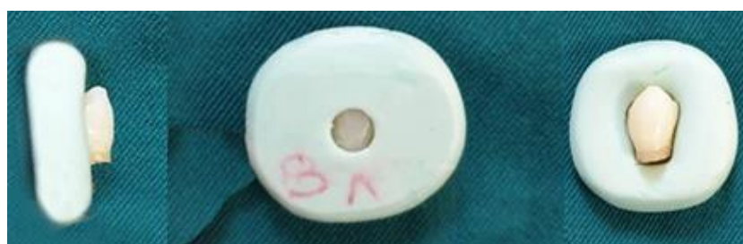
Figure 1: The putty mold used in this study for holding the test teeth to allow consistent measurement of L^* , a^* and b^* values

Molds were fabricated for each tooth using rubber impression material (Aquasil Soft Putty, Dentsply) (Figure 1). Holes with diameters of about 6 mm were created in the molds using a biopsy punch (KAI medical, Tokyo, Japan) so that the extent of discoloration could be measured at the same site. The hole was located so that it revealed an area between the midbuccal third and cervical third to facilitate observation of any