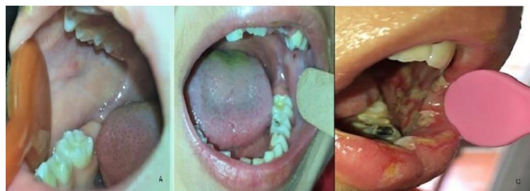
Figure 1: Severity of mucositis in patients, a: Grade 2 mucositis in the test group, b: Grade 2 mucositis in the control group, c: Grade 3 mucositis in the control group